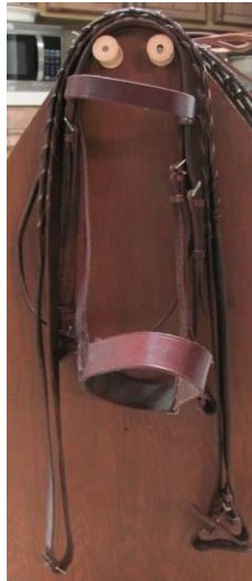
Hunt seat headstall & laced reins $20