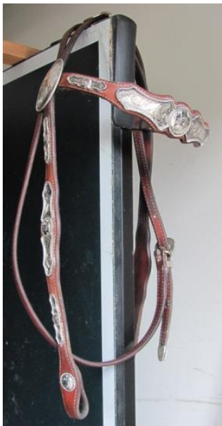
Champion Turf brand sterling silver overlay Headstall & Breast Collar set $475