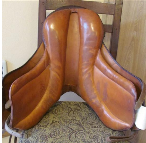
Borelli forward seat saddle 18" seat