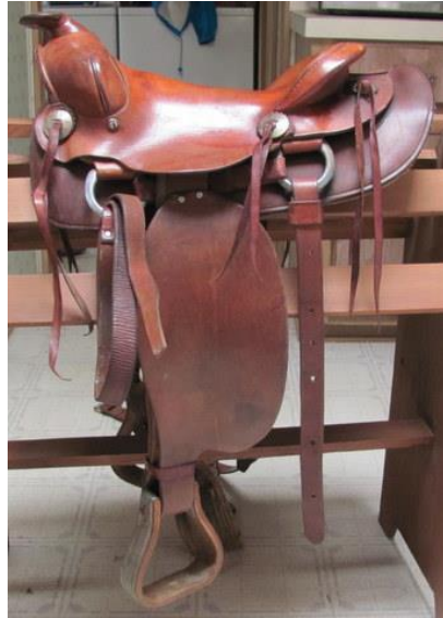
Western Youth Saddle 14" seat Fits 12-14 hand pony/horse Very good condition $225