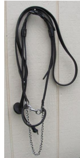
Black rolled leather Shetland show halter, oval conchos, leather throatlatch $20