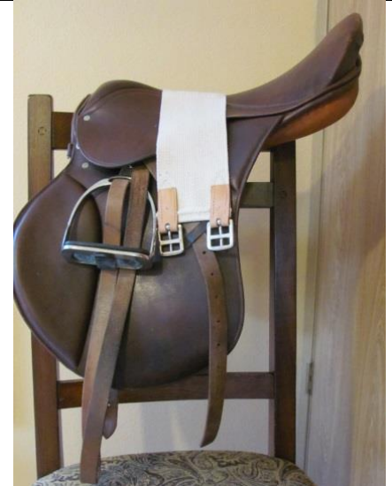
With fittings (leathers, irons w/ pads, new girth, and white pad, also breast plate [not pictured]) $225