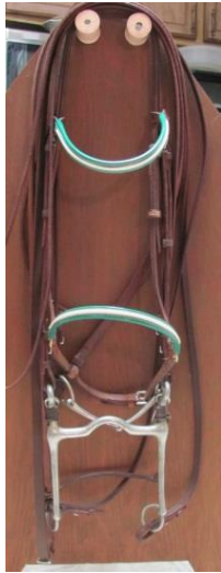
Saddleseat full bridle, made in England; includes weymouth, & bridleon $45